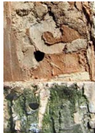
D-shaped exit hole EmeraldashBorer.info