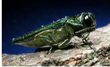
Adult Emerald Ash Borer

The first case was detected in Illinois in June in Kane County. Since then, the insect has also been found in Wilmette and Evanston. A quarantine zone has been established around 51 square miles of Kane County to contain the spread there. A survey of Cook County is currently underway. Once the survey in Cook County is complete, the quarantine will be amended to reflect the infestation in